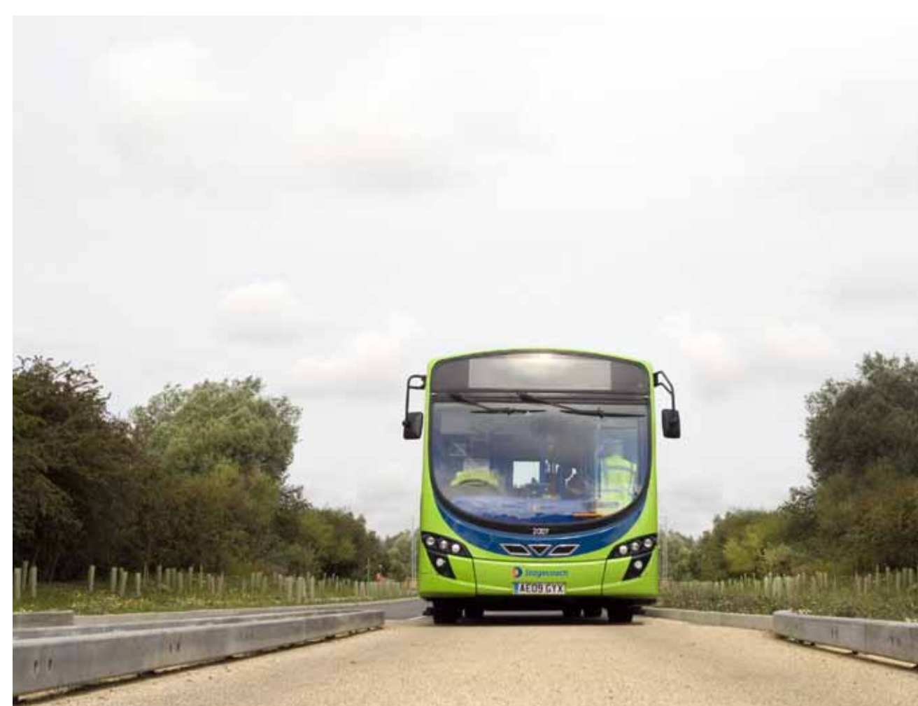
Below: Most residents will be within 400 meters of a bus stop.

For further information on the Highways Agency's proposals please refer to www.highways.gov.uk