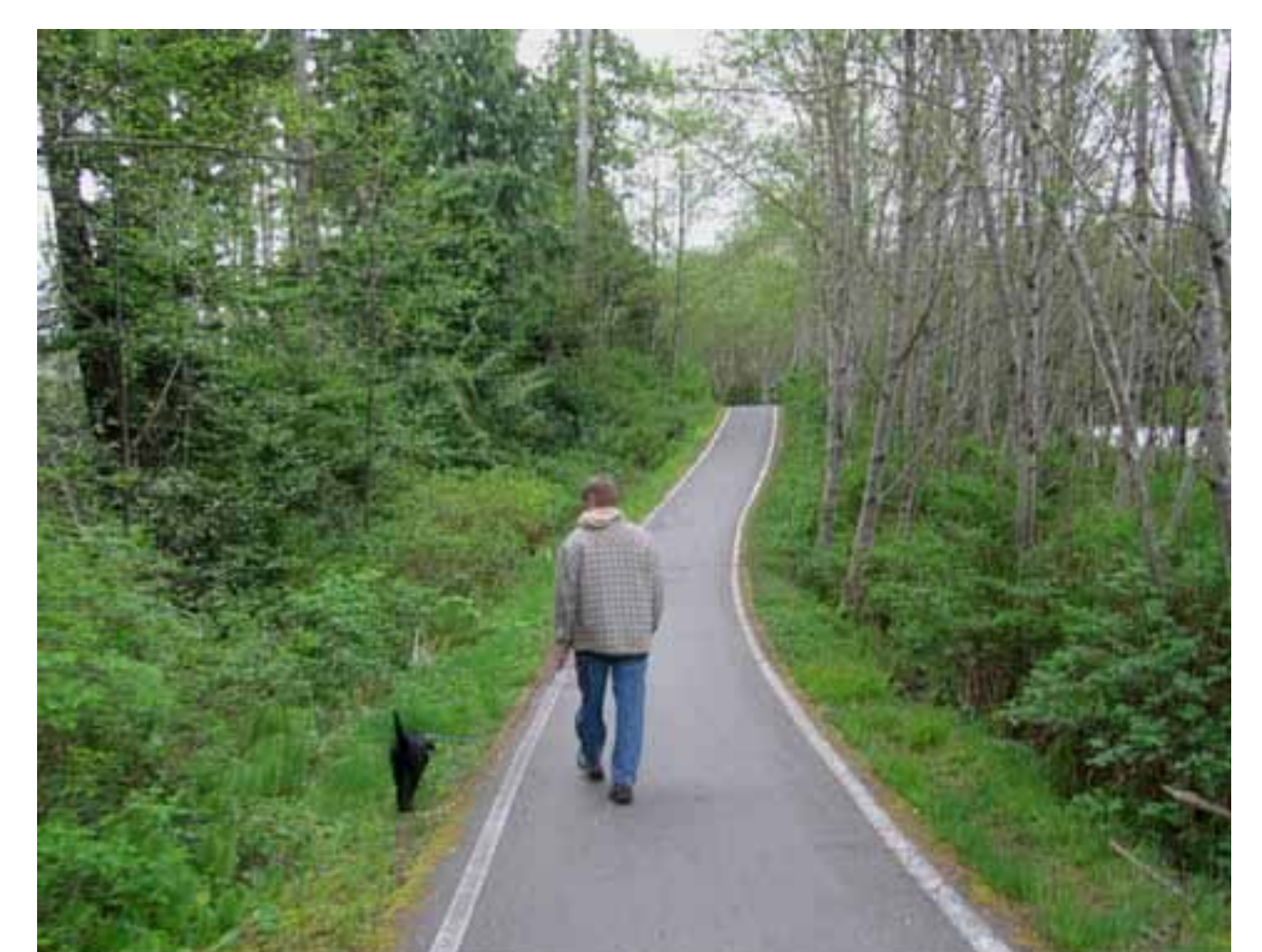
Above: A comprehensive network of cycle and walking routes will be provided throughout the development